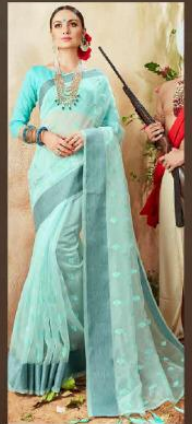
DESIGN NO. 57006