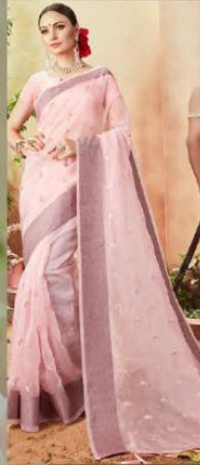
DESIGN NO. 57001