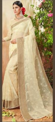
DESIGN NO. 57003