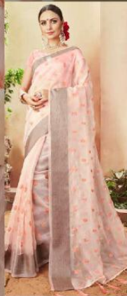
DESIGN NO. 57004