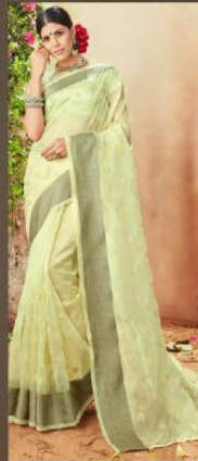
DESIGN NO. 57005