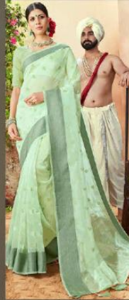
DESIGN NO. 57002