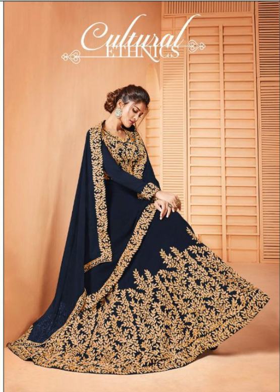
Demure and sensuous at the same time, a saree is definitely for modern woman. D.No.:2001