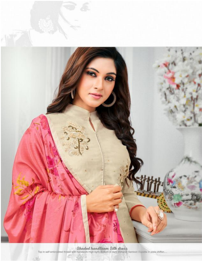
Shaded handloom Silk dress Top in self embroidered thread with handwork High-light, Bottom in dark Mehandi Santoon Dupatta in pista chiffon...