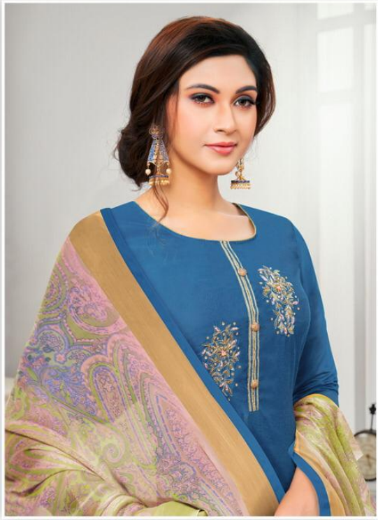
SHADED HANDLOOM SILK DRESS IN RED MULTI COLORS

Top in self embroidered thread with handwoven High Light. Bottom in dark Mahandi Sarlocon Dignette in pinkie chiffon.