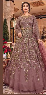
D.NO :- 6305