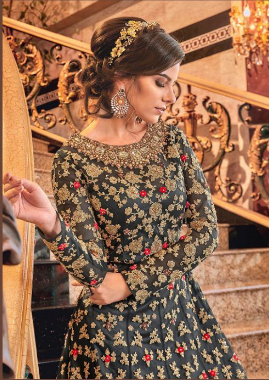
D.NO :- 6307