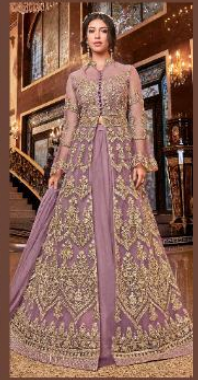
D.NO :- 6312