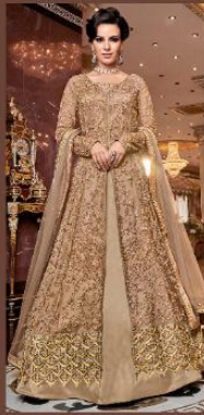
D.NO :- 6308