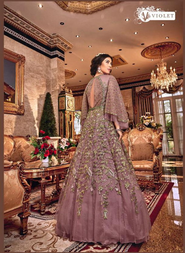
D.NO :- 6305