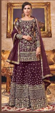
D.NO :- 6303