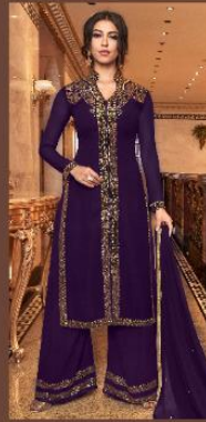
D.NO :- 6310