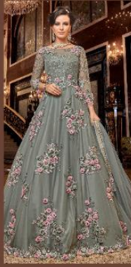
D.NO :- 6302