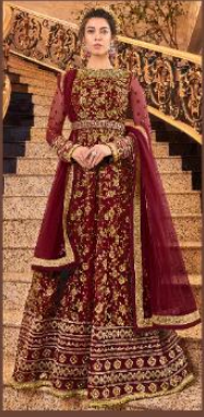
D.NO :- 6301