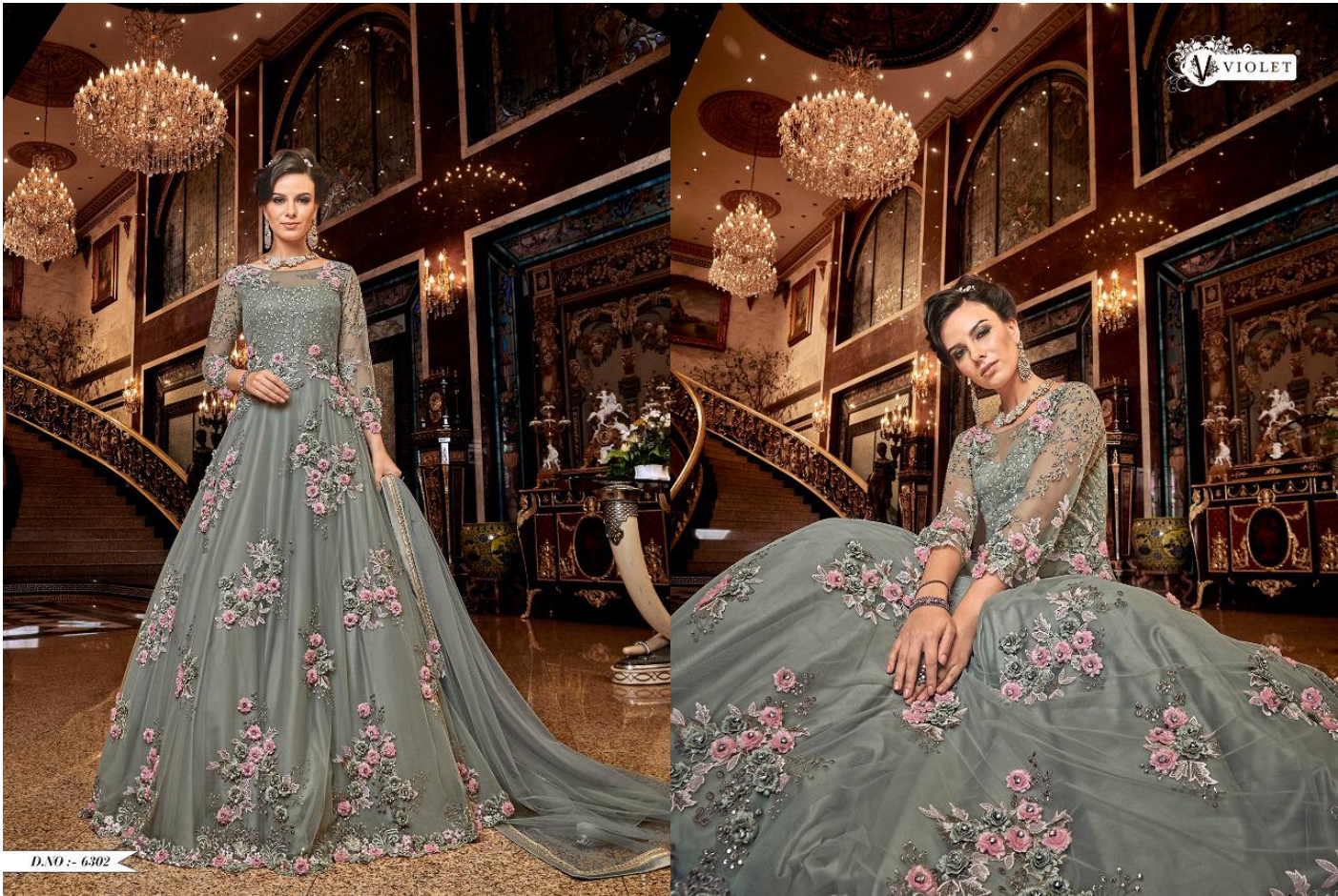
D.NO :- 6302