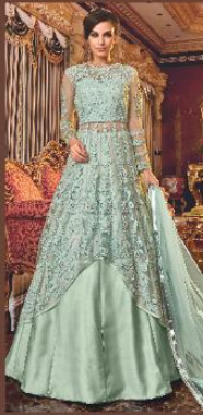
D.NO :- 6309