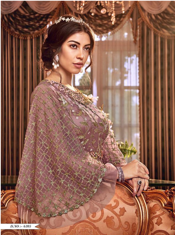
D.NO : - 6305