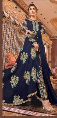
D.NO :- 6304