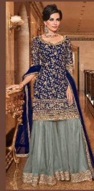
D.NO :- 6311