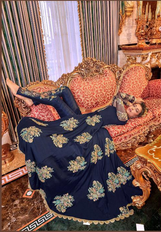
D.NO :- 6304