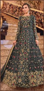
D.NO :- 6307