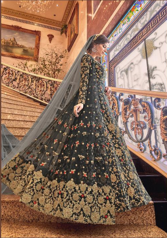
D.NO :- 6307