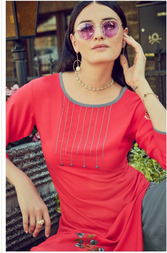
The most exciting style, art and cultural goings-on in INDIA and around the world