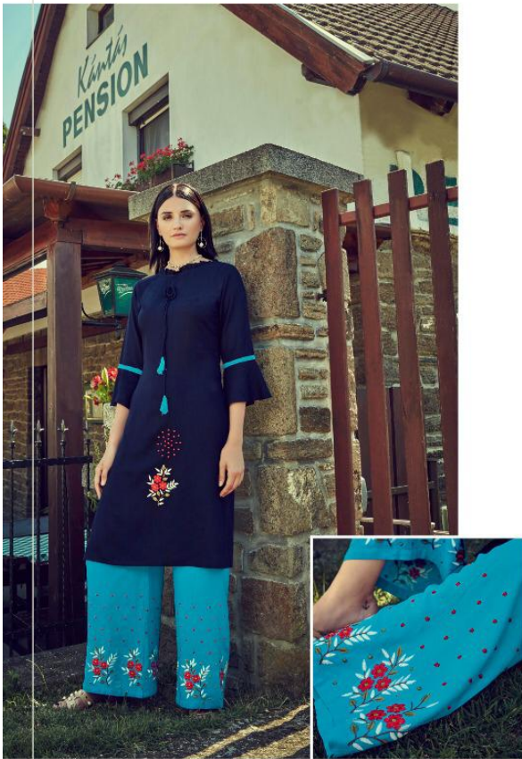
The most exciting style, art and cultural goings-on in INDIA and around the world