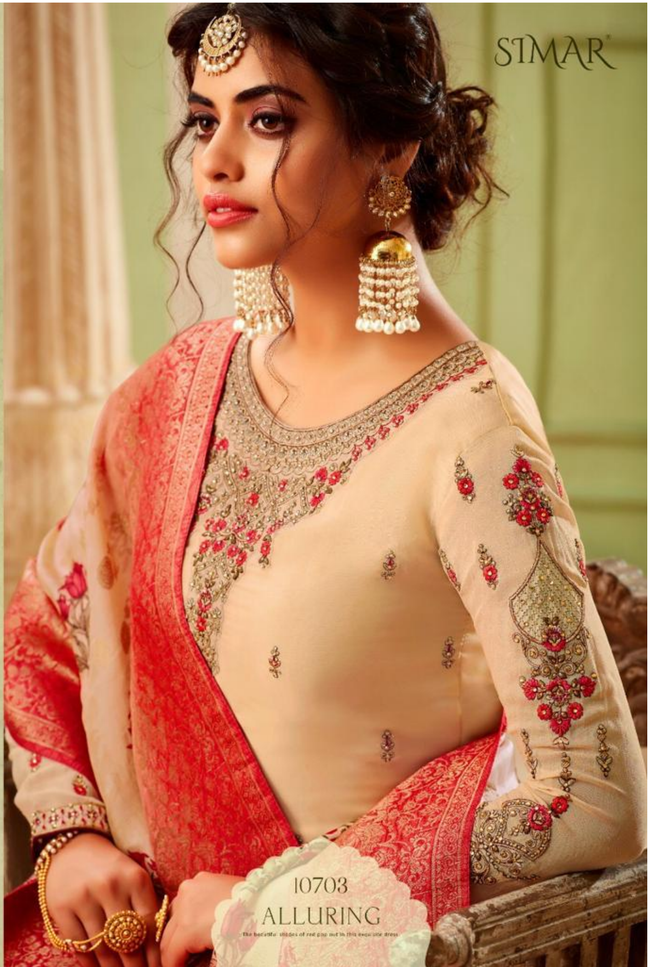
10703 ALLURING The beautiful shades of red pop out in this exquisite dress.