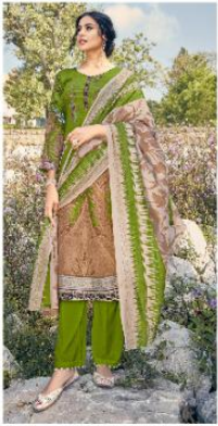
☞ DNo.8008 ☞