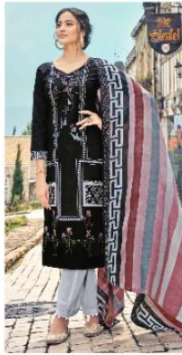
☞ DNo.8010 ☞