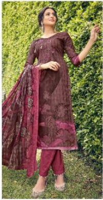
☞ DNo.8007 ☞