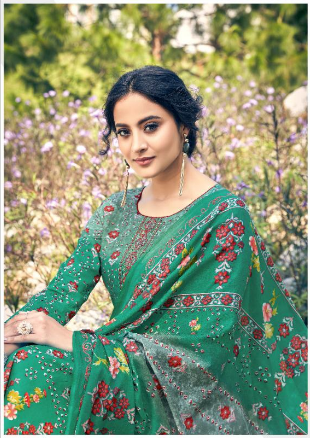
☒ DNo.8004 ☒