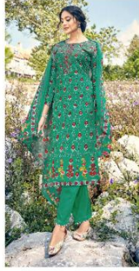
☞ DNo.8004 ☞