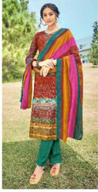
☞ DNo.8003 ☞