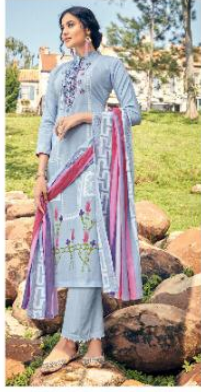
☞ DNo.8001 ☞