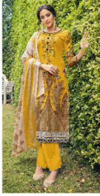
☞ DNo.8002 ☞