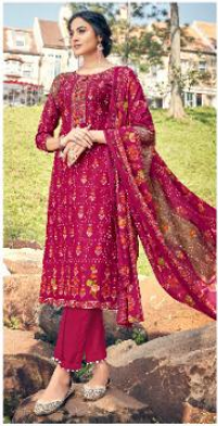
☞ DNo.8009 ☞