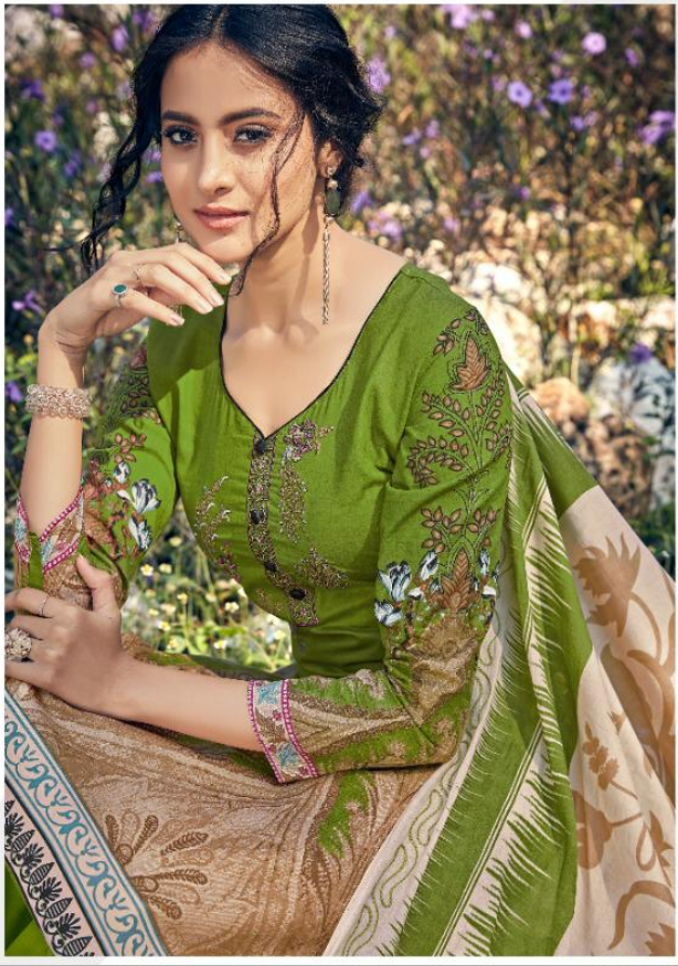
❧ DNo.8008 ❧