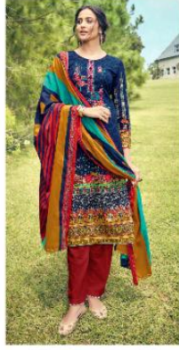
☞ DNo.8005 ☞