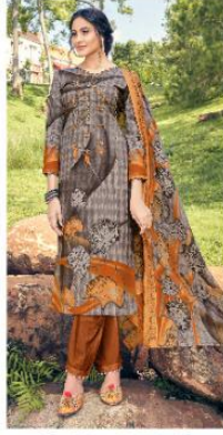
☞ DNo.8006 ☞