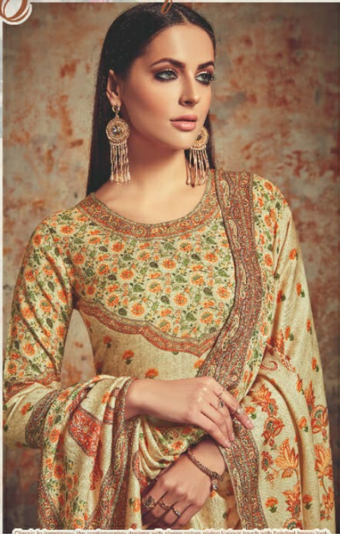
Classic to temporary- the contemporary designs with classy colors giving luxurious touch with finished heavy look.