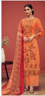
UMARAO | 1006