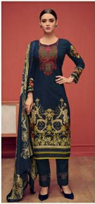
UMARAO | 1004