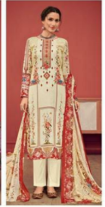
UMARAO | 1009