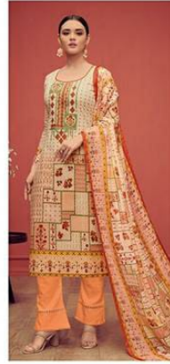
UMARAO | 1007