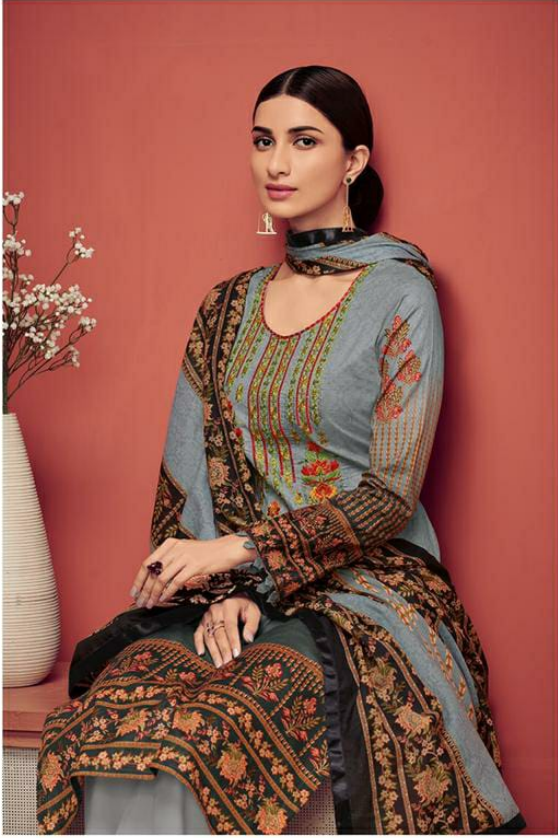
UMARAO | 1005