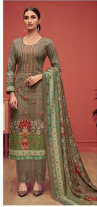
UMARAO | 1003