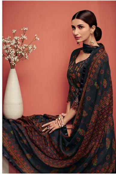
UMARAO | 1001