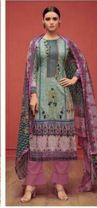
UMARAO | 1008