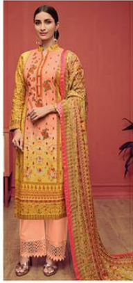
UMARAO | 1002