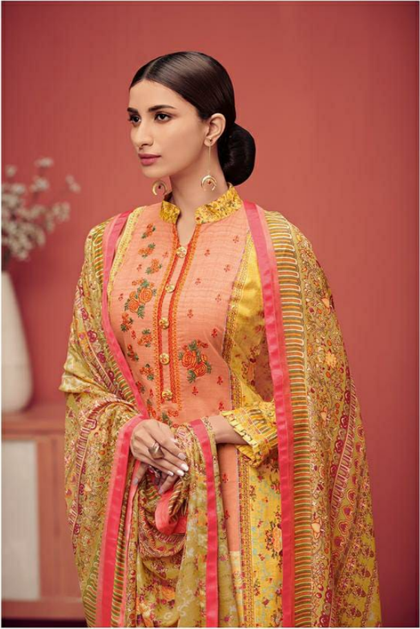
UMARAO | 1002