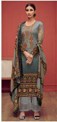
UMARAO | 1005