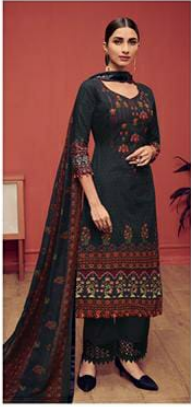
UMARAO | 1001