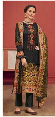
UMARAO | 1010