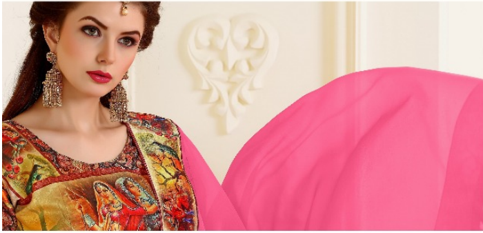
3011 A VARIATION OF ART WITH DIFFERET STYLE AND ATTITUDE ...