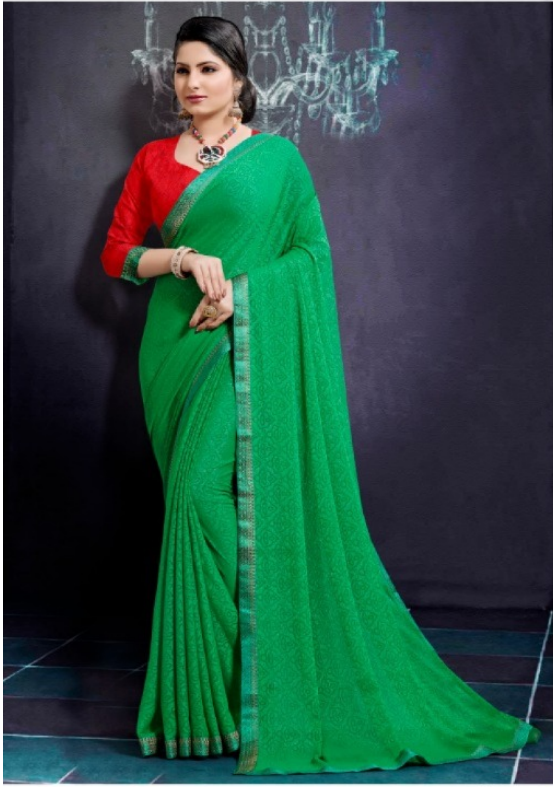
The classic colour combination strategically designed with an intrinsic need of latest print gives a contemporary edge to give an ideal piece for evening