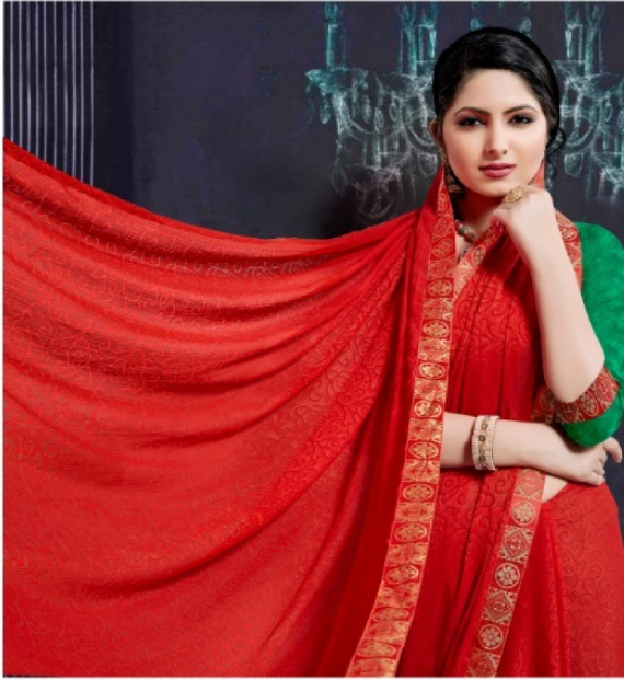
The classic colour combination, strategically designed with an intrinsic use of kalamkari print, gives a contemporary edge to piece, an ideal piece for evening.