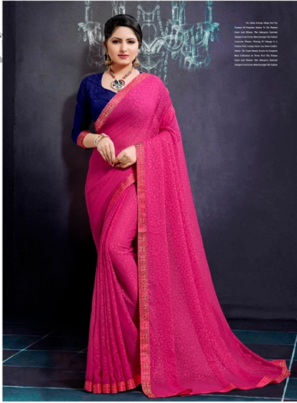
The classic colour combination strategically designed with an intricate, motif of Kalamkari print, gives a contemporary edge to give an ideal piece for evening.