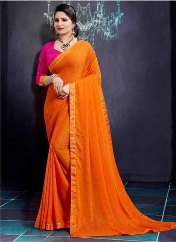
The classic colour combination strategically designed with an intricate weid of kalankai silk gives a contemporary edge to piece, an ideal piece for evening