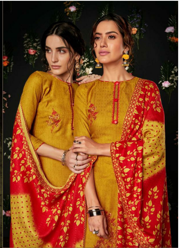
128 - 004 Now's the time to be a little more adventures in prints and colours of your dress experience the exotic floral bliss.