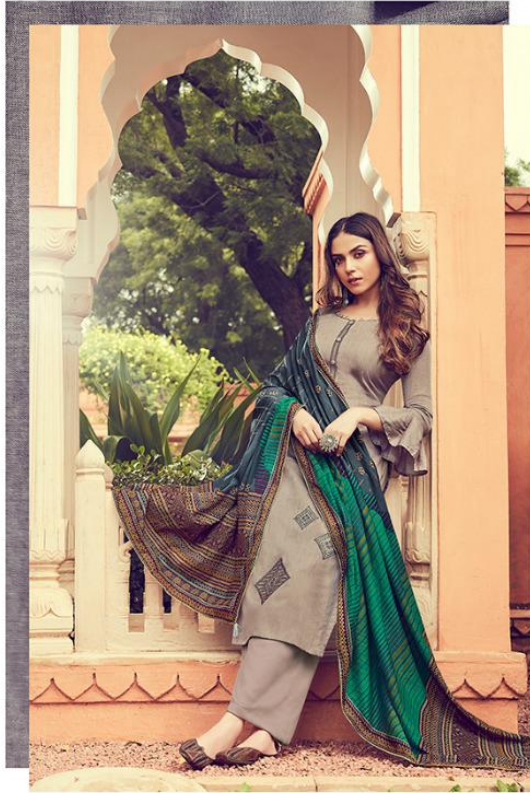
fashionable tributes to colors and silhouettes that have inspired trends around the world.