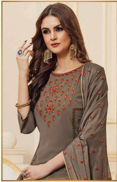
Get dazzled with vivacious colors of India and bring out the ethnic side of you with this beautifully crafted piece.