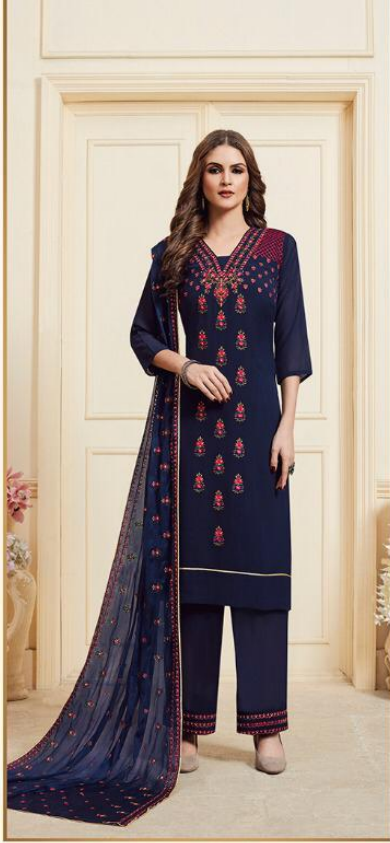
The flavor of subtle ethnic wear that meets the contemporary glam vividly explodes with minute details of elegance.