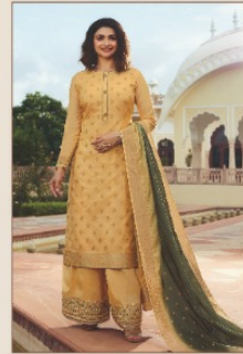
◀ 11408 ▶