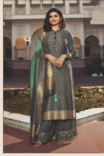
◀ 11402 ▶