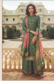
◀ 11405 ▶