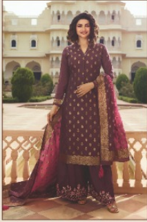
◀ 11401 ▶