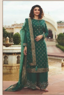
◀ 11407 ▶