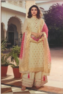
◀ 11403 ▶