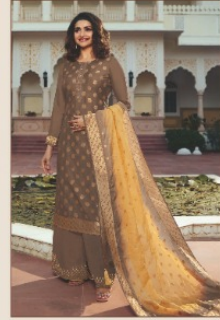
◀ 11406 ▶