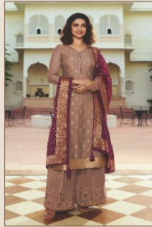
◀ 11404 ▶