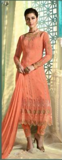
+ 10018 +