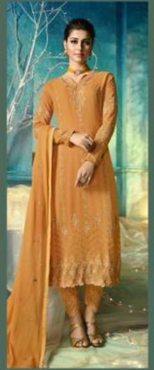
+ 10021 +