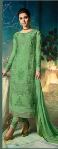
+ 10020 +