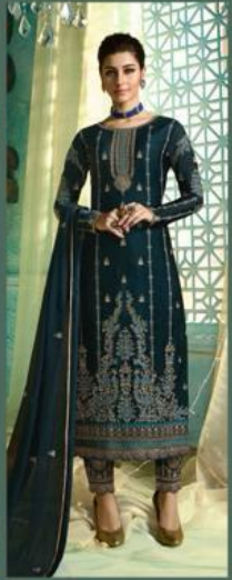
+ 10019 +