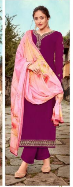
***** * D.No. 13006 *