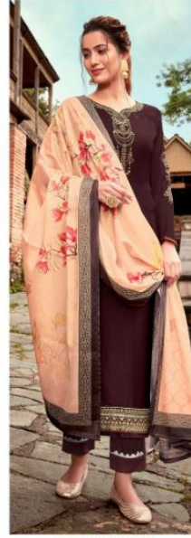
***** * D.No. 13004 *