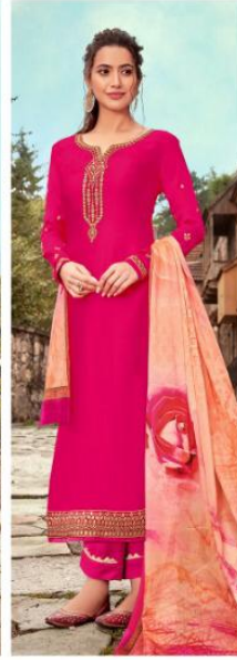
***** * D.No. 13003 *