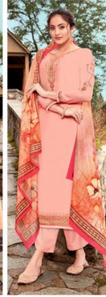
***** * D.No. 13005 *