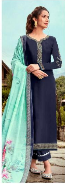
***** * D.No. 13002 *