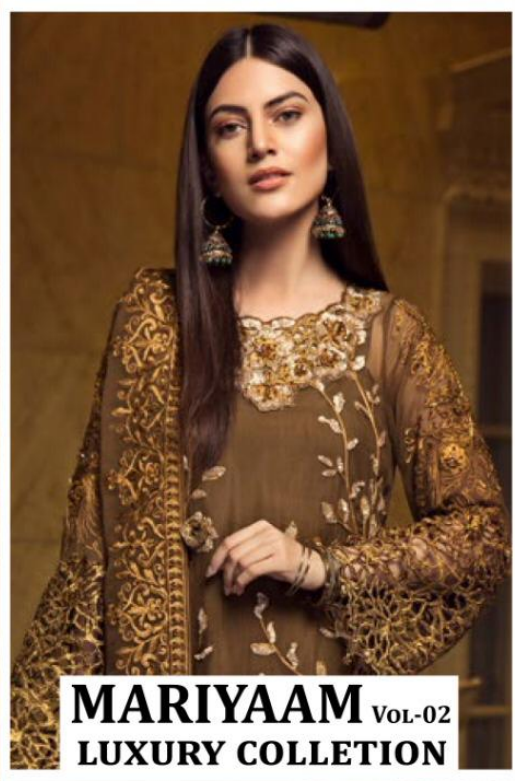
MARIYAAM Vol-02 LUXURY COLLETION