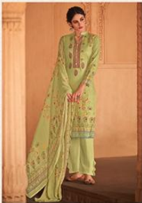
SULTANA | 2004