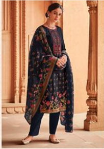
SULTANA | 2002