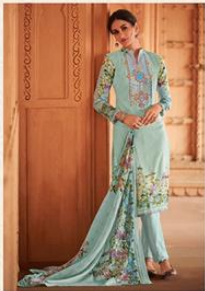
SULTANA | 2006