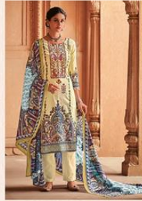
SULTANA | 2008