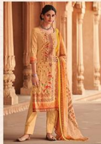
SULTANA | 2009