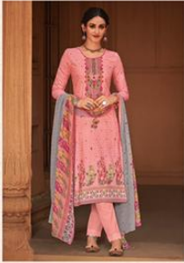
SULTANA | 2001