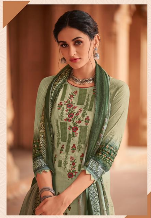
SULTANA | 2005