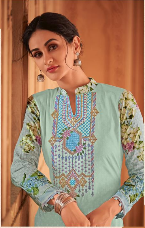
SULTANA | 2006