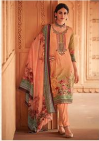
SULTANA | 2003