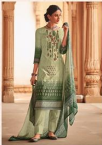
SULTANA | 2005