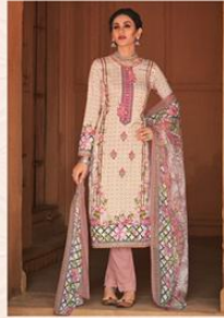
SULTANA | 2007