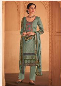
SULTANA | 2010