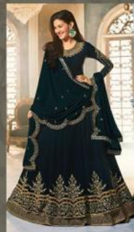
D. No. 9061