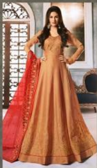
D. No. 9059