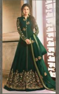
D. No. 9058