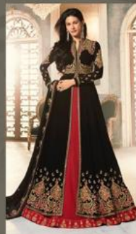
D. No. 9060