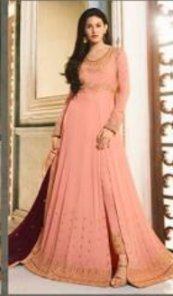
D. No. 9057