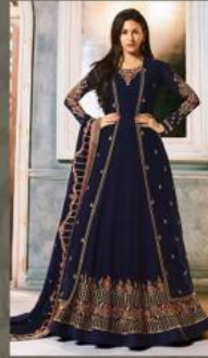
D. No. 9056