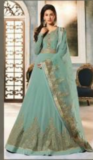
D. No. 9055