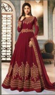
D. No. 9054