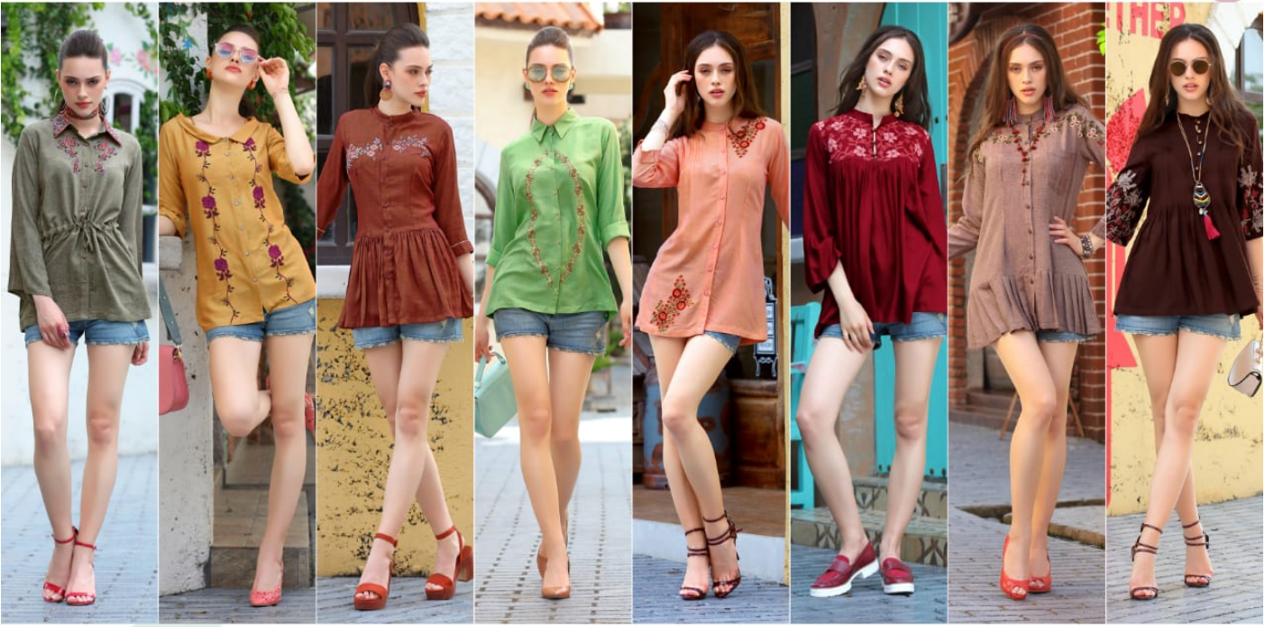
DNO - 101