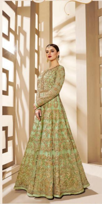
the flavor of subtle ethnic wear that meets the contemporary glam vividly explodes with minute details of elegance