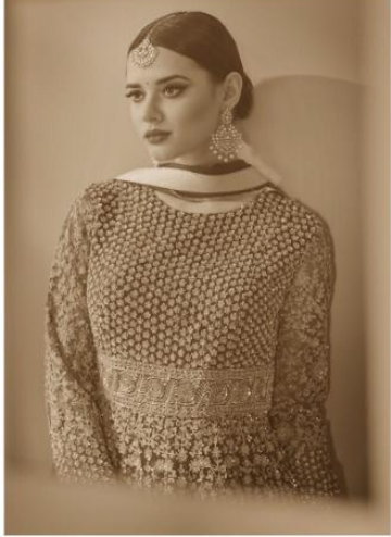
this sparkling beauty of attire will work their magic on everything in your wardrobe.