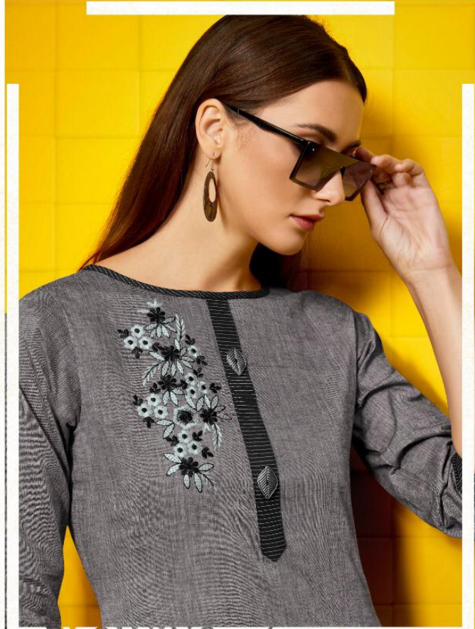
FLOWING elegance 1005