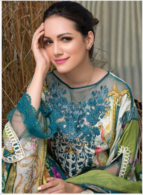
allie DESIGN NUMBER-096 ♦ DEEPSY SUITS ♦