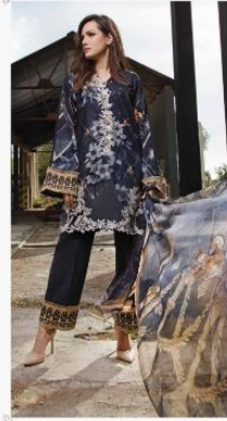
DESIGN NUMBER 095