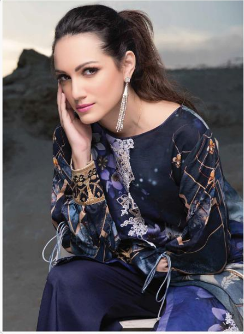
DS DESIGN NUMBER-091 ♦ DEEPSUITS ♦