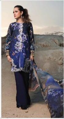
DESIGN NUMBER 091