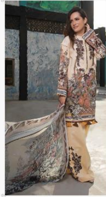
DESIGN NUMBER 094