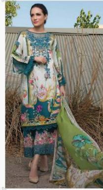
DESIGN NUMBER 096