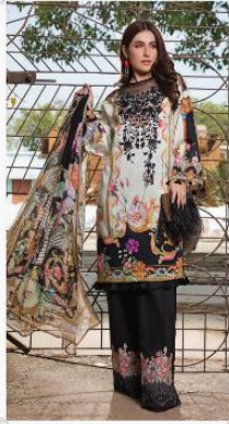
DESIGN NUMBER 093