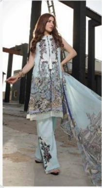
DESIGN NUMBER 092