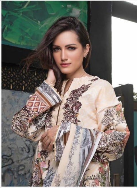
DS DESIGN NUMBER-094 ♦ DEEPSUITS ♦