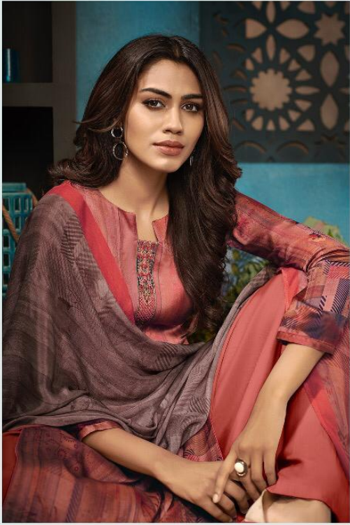
How beautiful is that! D.no:- 064