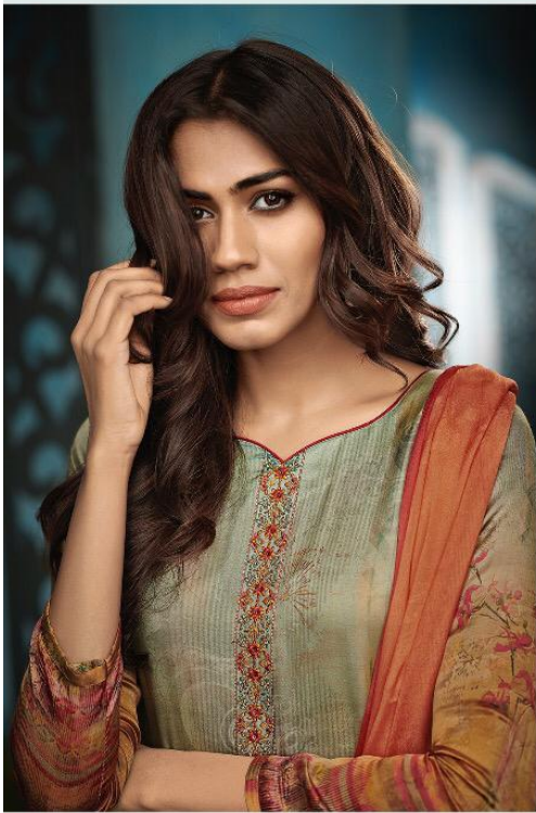
How beautiful is that! D.no.- 065