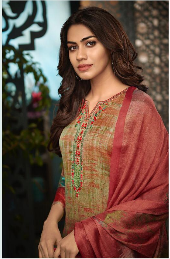
How beautiful is that! S.no:- 070