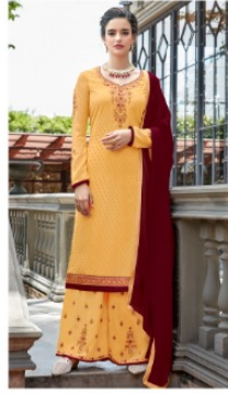
CODE # 2104