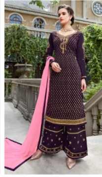
CODE # 2105