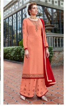
CODE # 2106