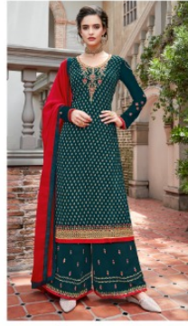
CODE # 2101

REPROGRAM THE FUTURE OF THE STYLE. BECAUSE THE STYLE SAY BOLD BIRCHES LOOKS