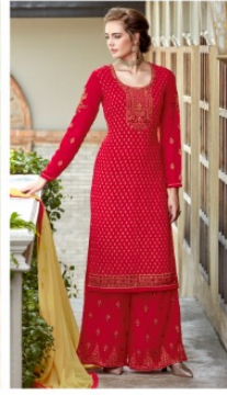
CODE # 2102