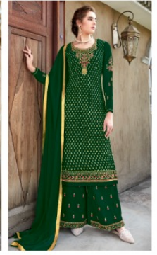
CODE # 2103