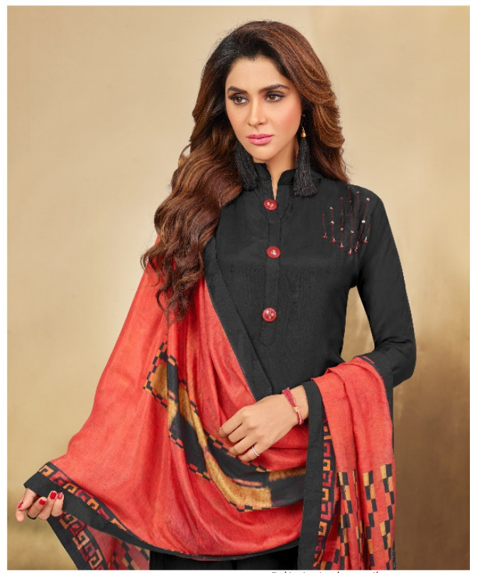
Fashion is art and you are the canvas