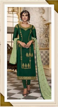
D.NO - 88004