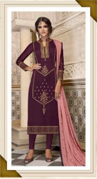
D.NO - 88003