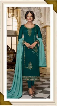
D.NO - 88006

lavina™ TOP SATIN GEORGET WITH HEAVY EMBROIDERY INNER & BOTTOM FULL DULL SHANTOQM DUPTTA NAZNIN EMBROIDERY WITH LESSPATTI