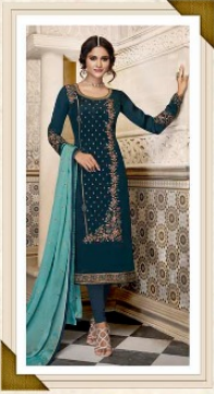
D.NO - 88001