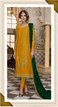
D.NO - 88005