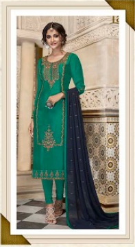
D.NO - 88002