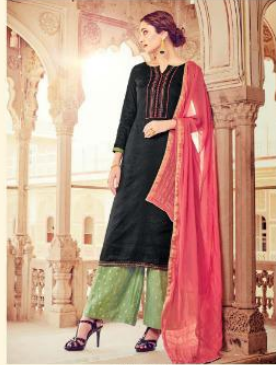
D. NO. 144- 006