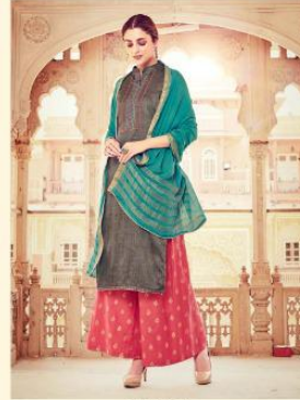
D. NO. 144- 007