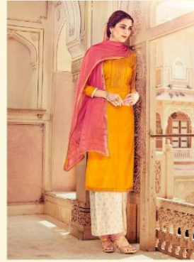
D. NO. 144- 003