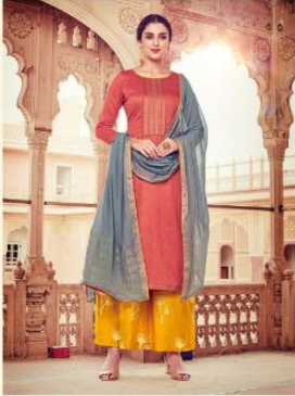
D. NO. 144- 005