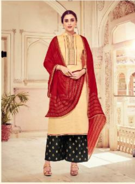
D. NO. 144- 001