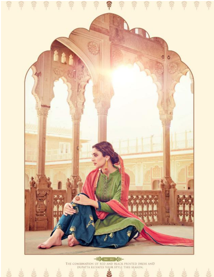
THE COMBINATION OF RED AND BLACK-PRINTED DRESS AND DUPETTA ELEVATES YOUR STYLE THIS SEASON.