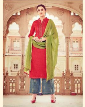
D. NO. 144- 008