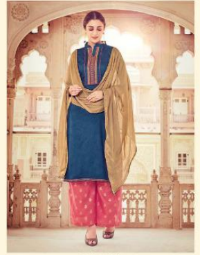
D. NO. 144- 004