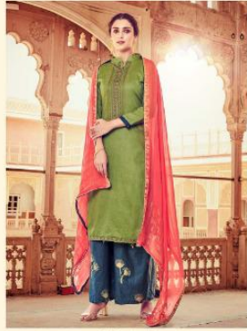
D. NO. 144- 002