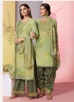
5 1 0 7