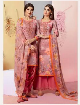
5 1 0 6