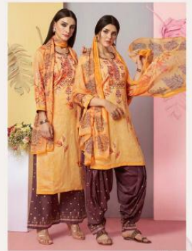
5 1 0 8