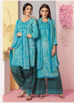
5 1 0 5