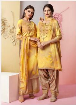
5 1 0 3