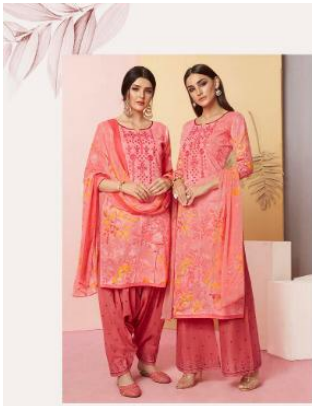
5 1 0 1