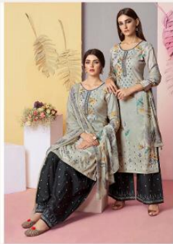
5 1 0 4