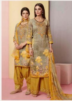
5 1 0 2