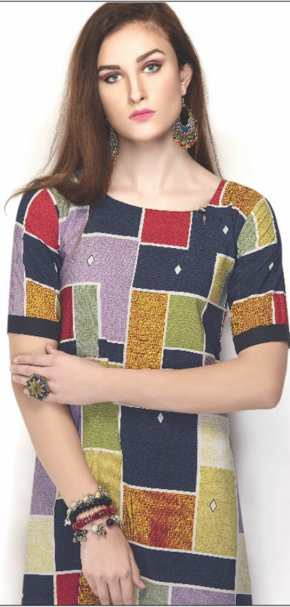
राष्ट्रिका SHADES V/140