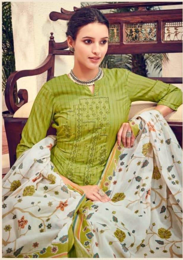
Inject appeal to your street chic style with a morley of patch work and patch work prints in dresses