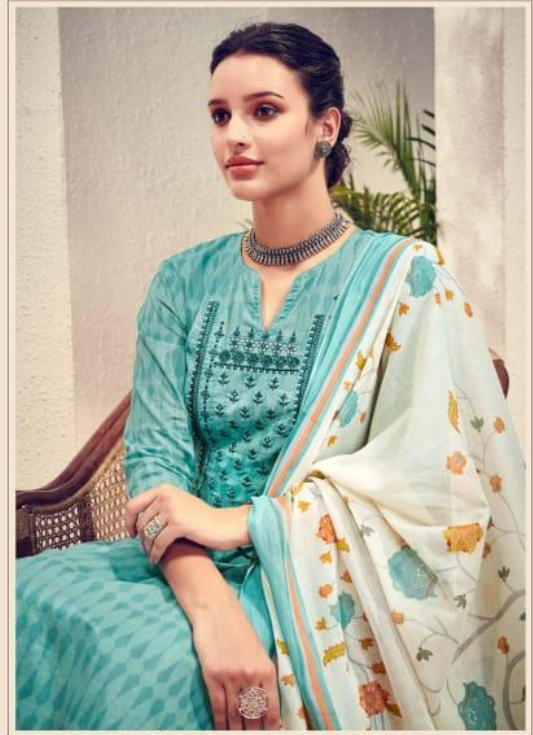
Inject appeal to your street chic style with a morley of patch work and patch work prints in dresses.