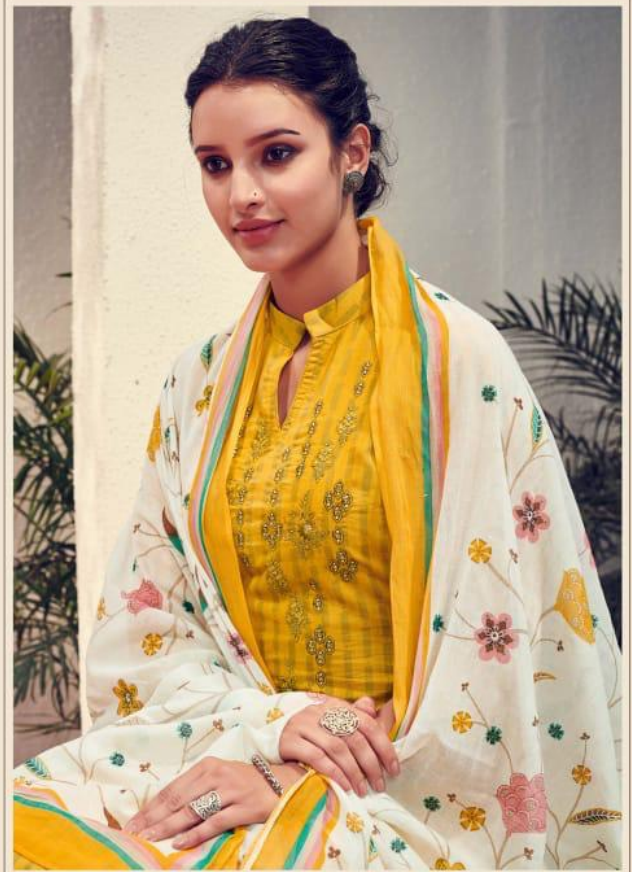
Inject appeal to your street chic style with a monley of patch work and patch work prints in dresses.