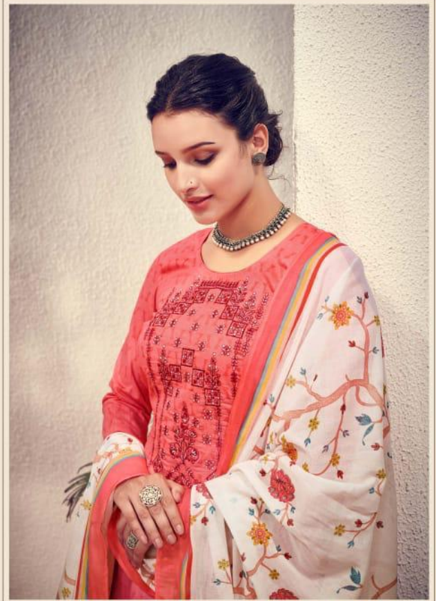
Inject appeal to your street chic style with a monley of patch work and patch work prints in dresses.