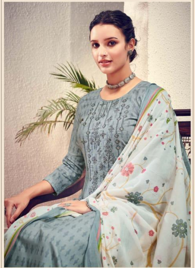
Inject appeal to your street chic style with a monley of patch work and patch work prints in dresses.