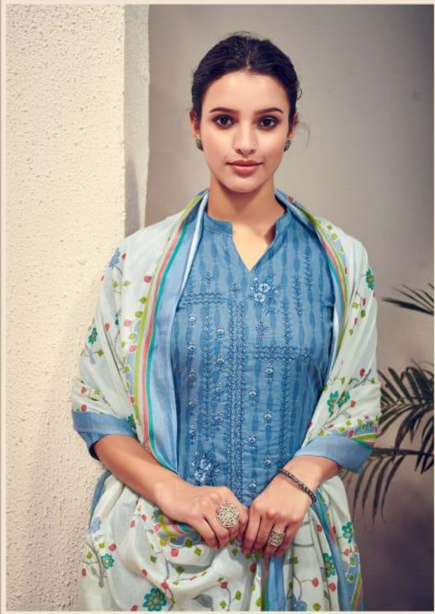
Inject appeal to your street chic style with a motley of patch work and patch work prints in dresses