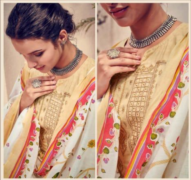
Impact appeal to your street chic style with a montage of patch work and patch work prints in dresses.