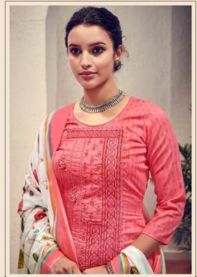
Impact appeal to your street chic style with a monrey of patch work and patch work prints in dresses.