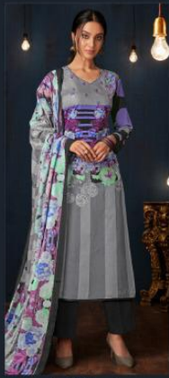
{ 8909 }