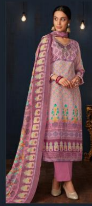
{ 4906 }