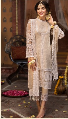
|| D.NO 1001 ||