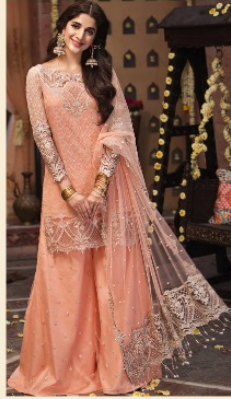
|| D.NO 1002 ||