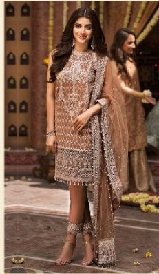
|| D.NO 1004 ||