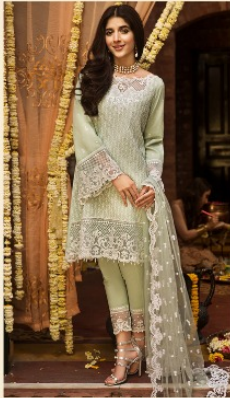
|| D.NO 1003 ||