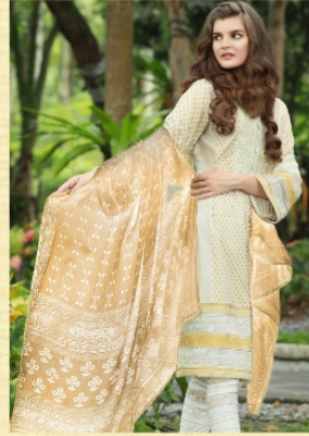
• 300-204 •