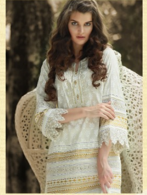
• 300-205 •