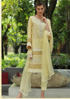
• 300-202 •