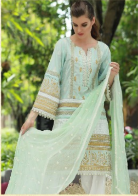
• 300-201 •