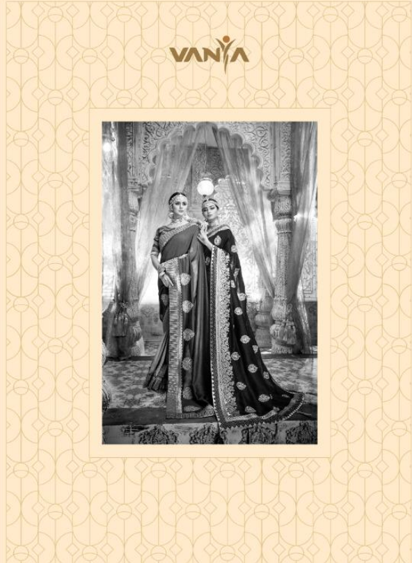
STYLED IN your rich ensembles, with emphasis on different colors complemented by GOOD DESIGN.