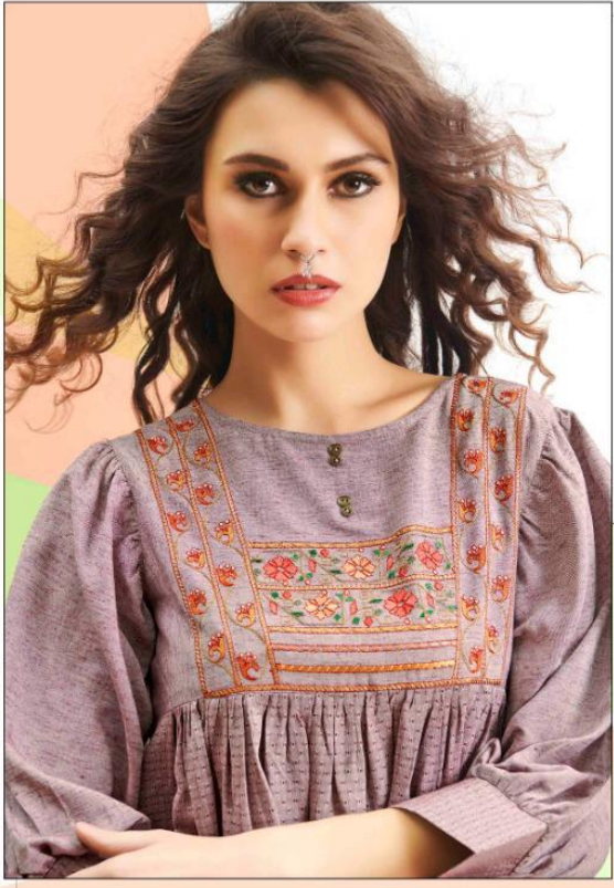
SOME HIGH OCTANE GLAMOUR INTO YOUR WARDROBE WITH THIS EMBELLISHED DRESS DESIGNED WITH THE LATEST FASHION TRENDS IN MIND. GET GOING WITH THIS FABULOUS COLLECTION FOR DESIRED GET-UP.