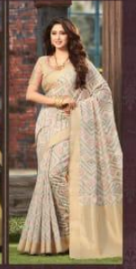
FS - 5505 / B