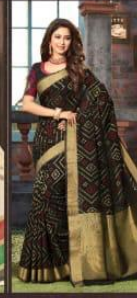
FS - 5505 / A