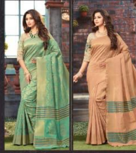
FS - 5503 / B