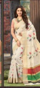
FS - 5504