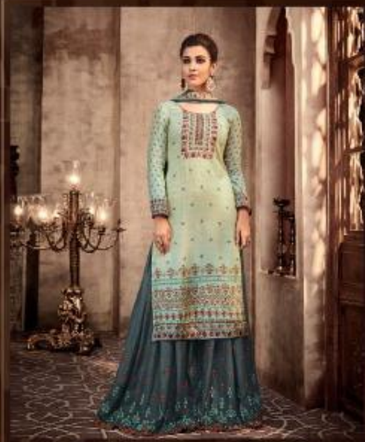
★ Glamour-68002 ★