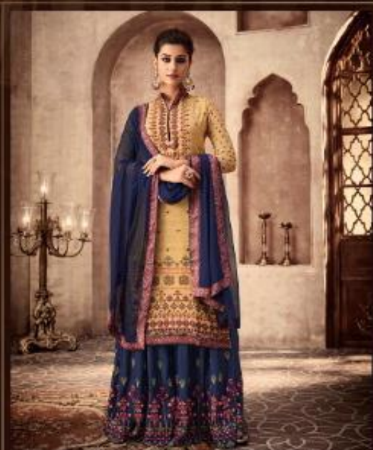
★ Glamour-68004 ★