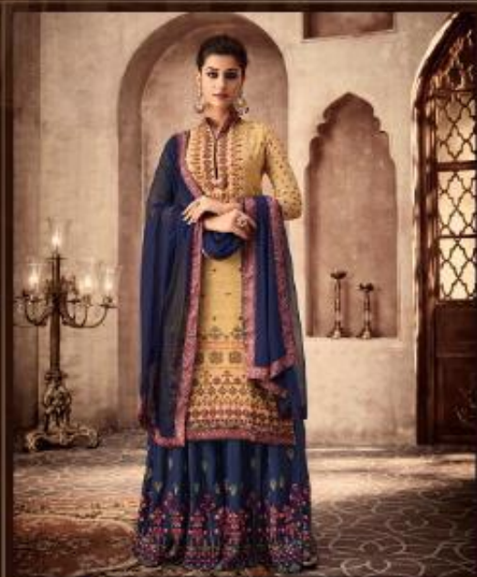
★ Glamour-68004 ★