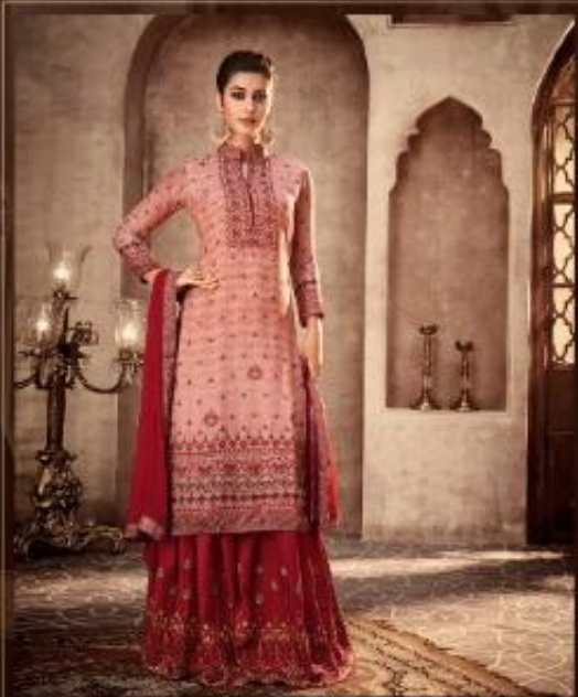
★ Glamour-68003 ★