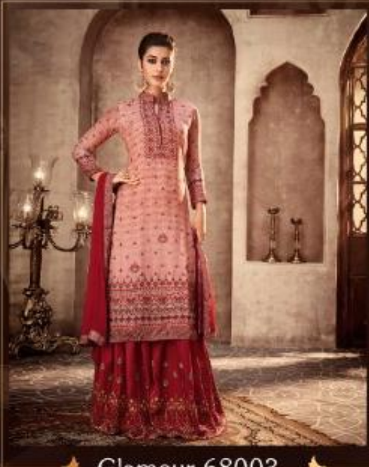
★ Glamour-68003 ★