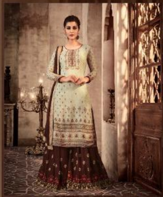
★ Glamour-68001 ★