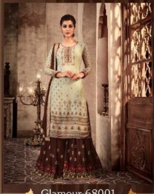
★ Glamour-68001 ★