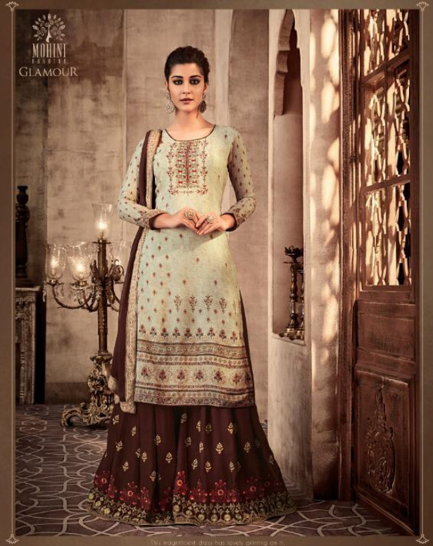
It's magnificent dress has lovely printing on it.