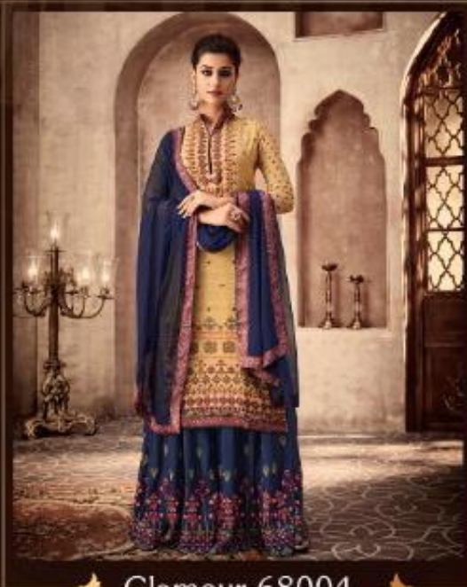
★ Glamour-68004 ★