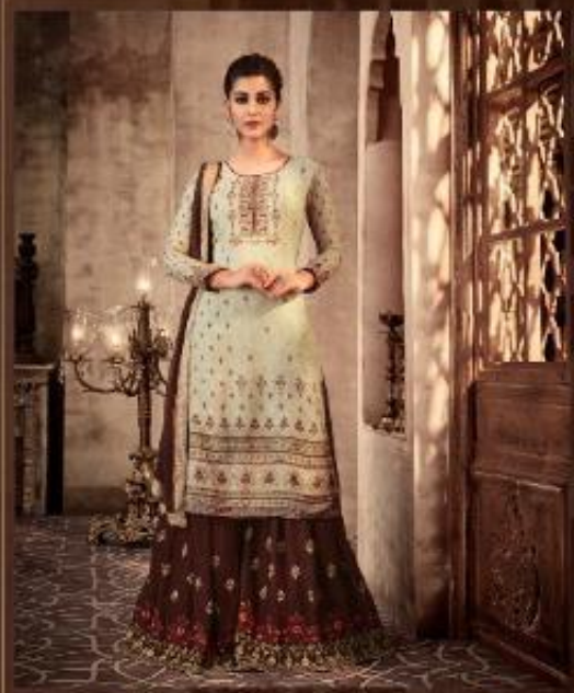
★ Glamour-68001 ★