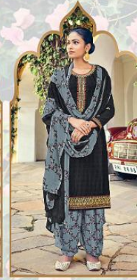
Style No. 9205