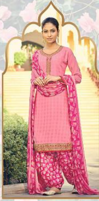
Style No. 9202