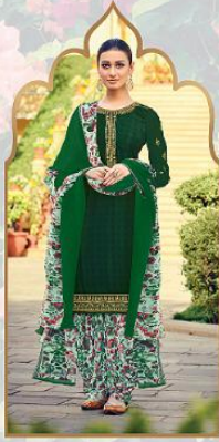
Style No. 9203