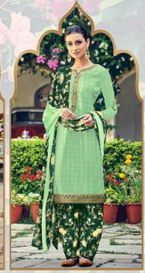
Style No. 9206