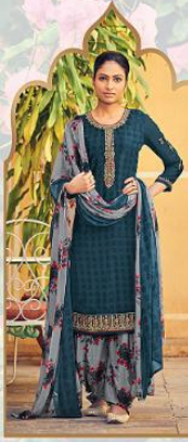
Style No. 9201