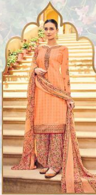
Style No. 9208