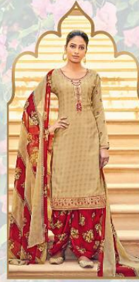
Style No. 9204