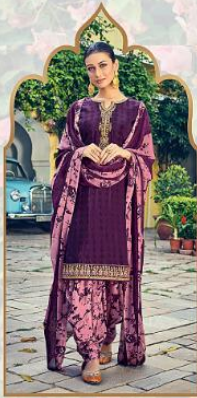
Style No. 9207