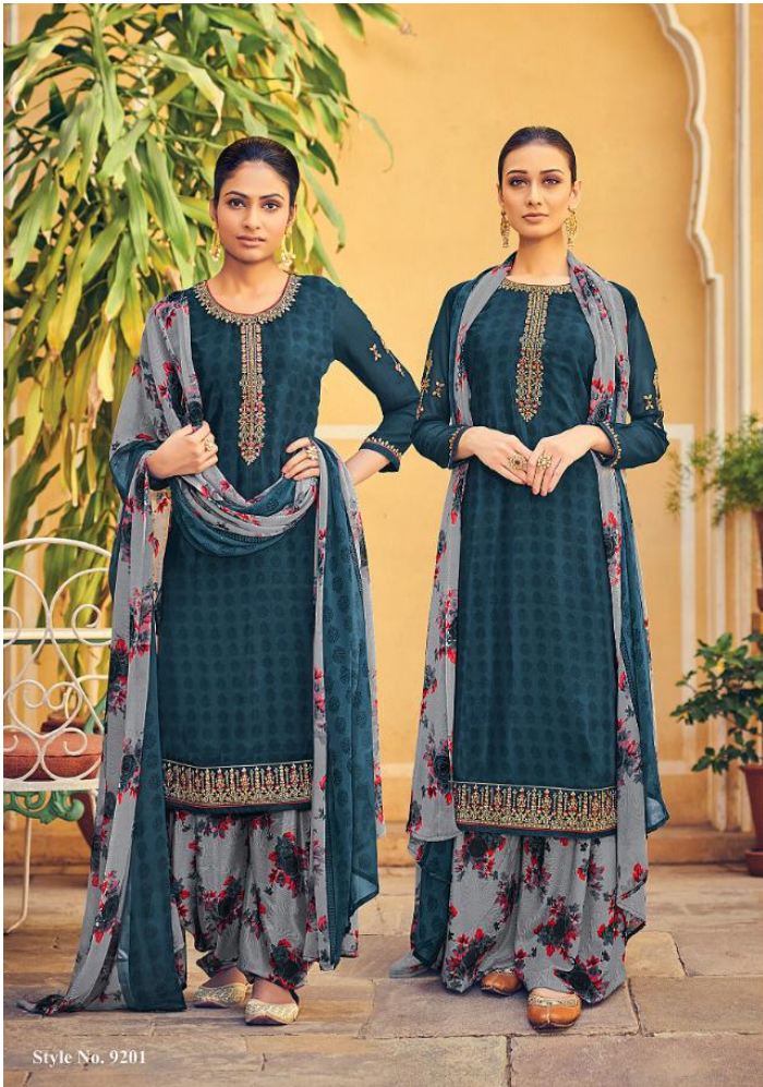
Style No. 9201