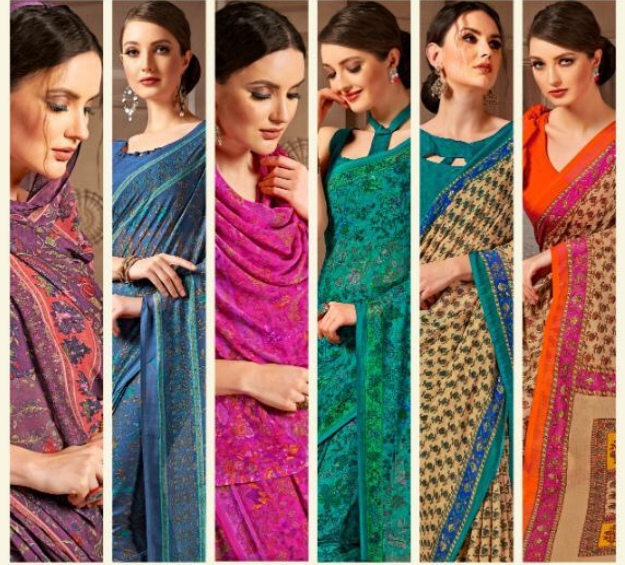
5304a 5304b 5305a 5305b 5306a 5306b