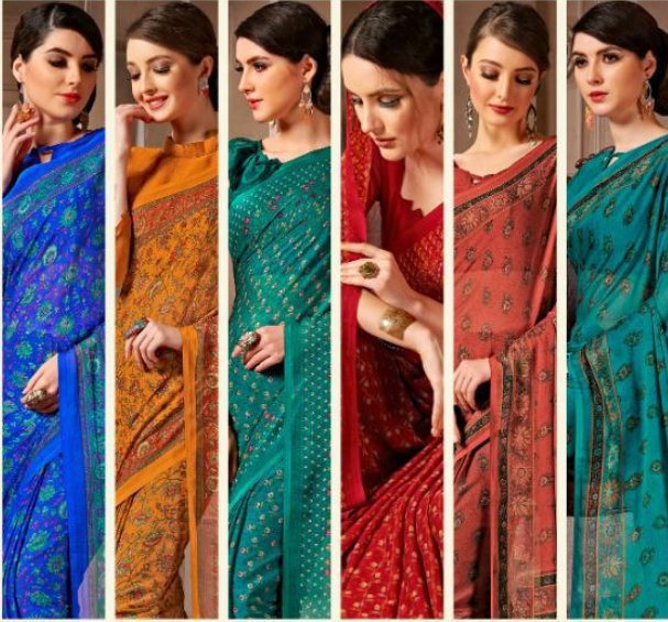
5301a 5301b 5302a 5302b 5303a 5303b