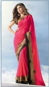
D. NO: 2554