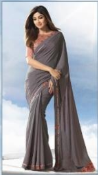
D. NO: 2553