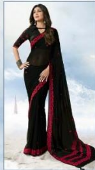
D. NO: 2558