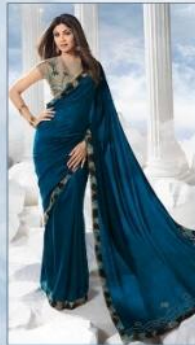
D. NO: 2557