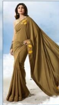
D. NO: 2559