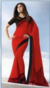
D. NO: 2551