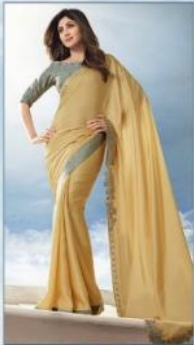
D. NO: 2556