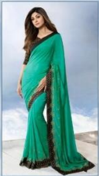
D. NO: 2552