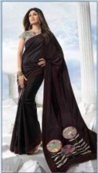
D. NO: 2555