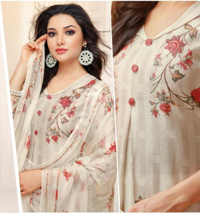
DRESS AS IF YOU'RE ALREADY FAMOUS.