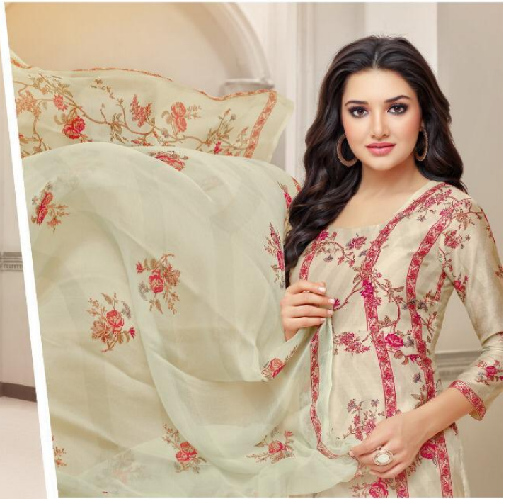
ALWAYS CLASSY NEVER TRASHY AND A LITTLE BIT SASSY