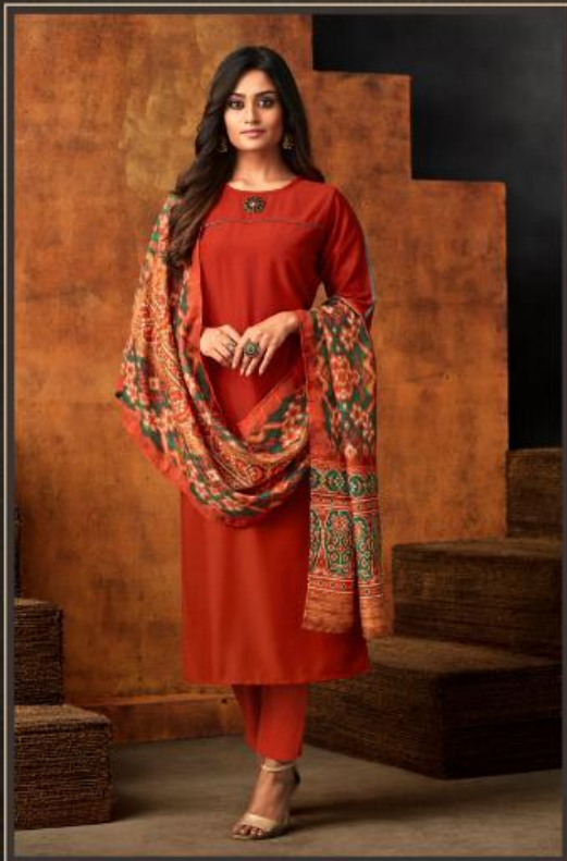
MONALISA - 1003