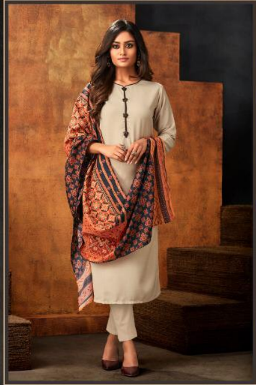
MONALISA - 1002