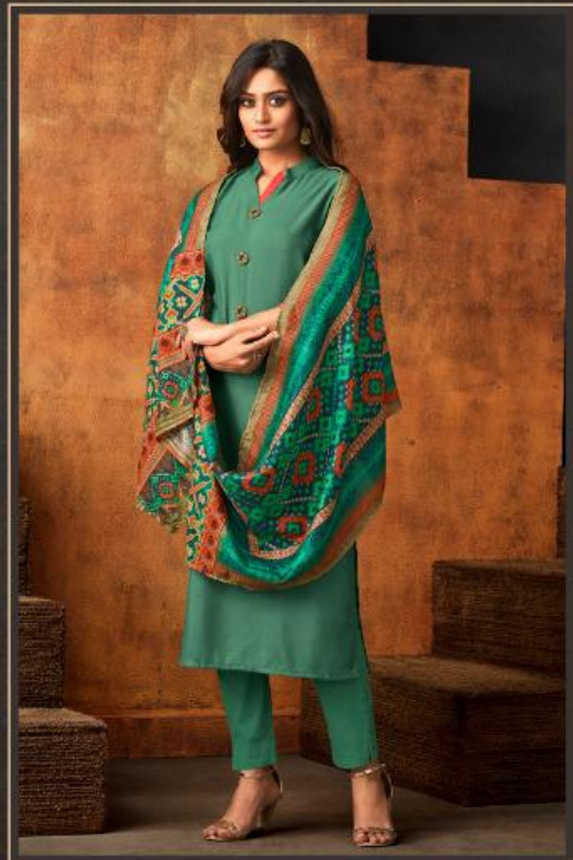
MONALISA - 1004