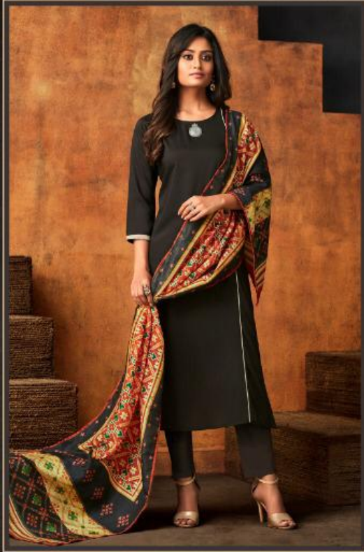
MONALISA - 1001