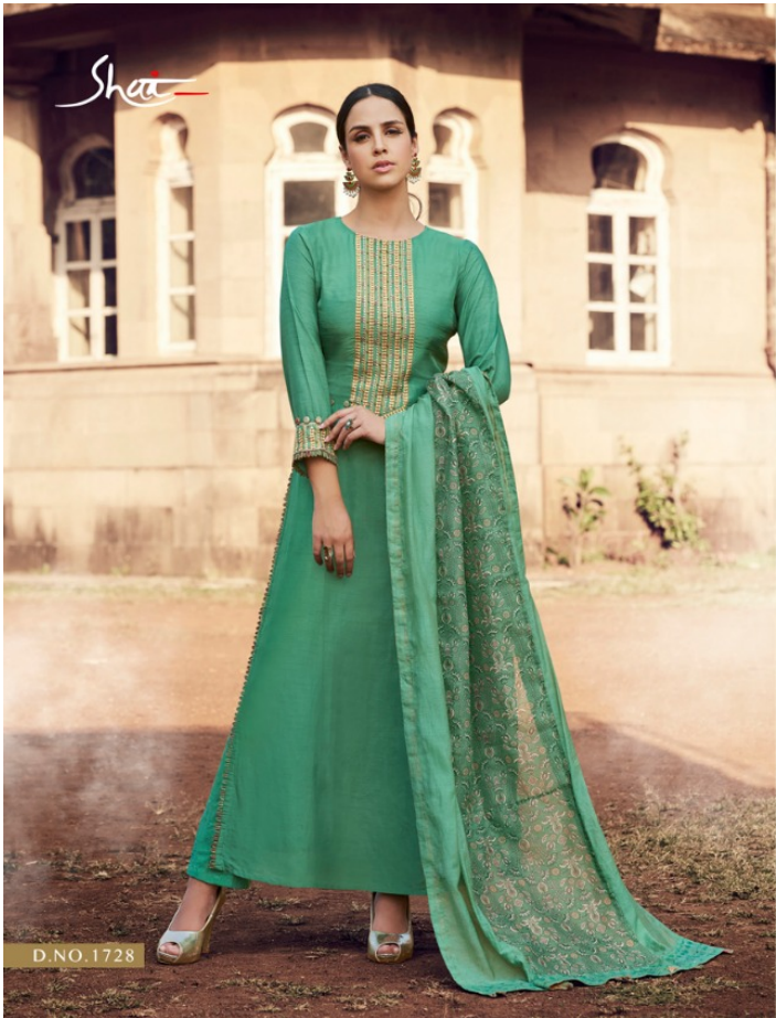
good style and a good costume