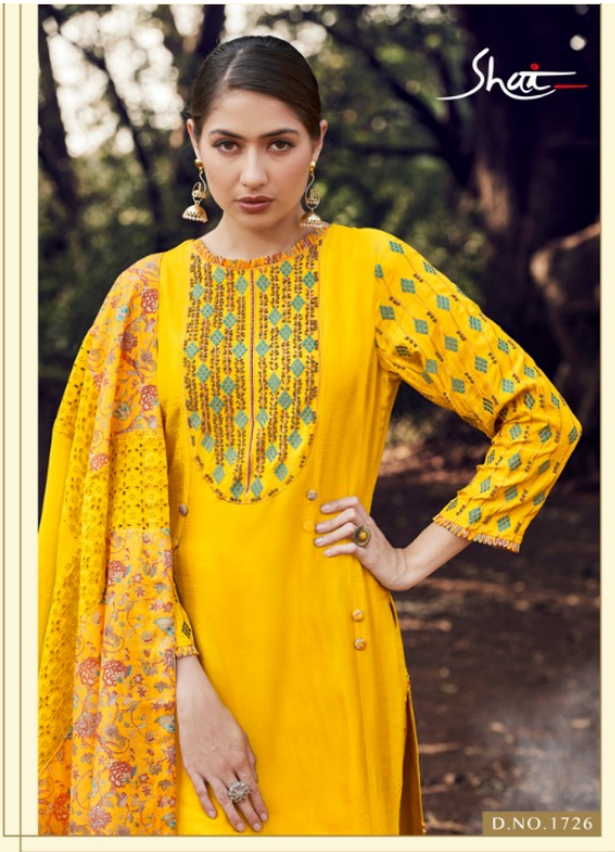
This suit is detailed with traditional design print is a must have in every women's ethnic collection.