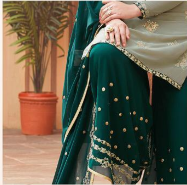
The world of beautiful Brides...