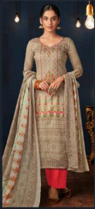
{ 8907 }