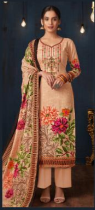
{ 8901 }