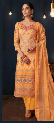
{ 8904 }