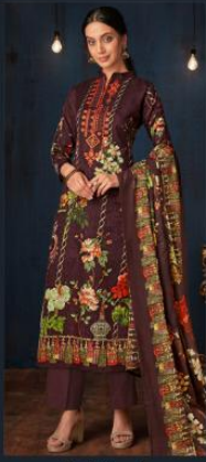
{ 8908 }