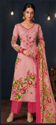
{ 8903 }