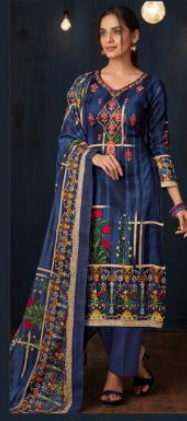
{ 4905 }