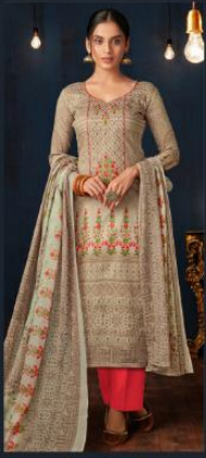
{ 8907 }