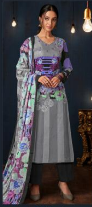
{ 8909 }