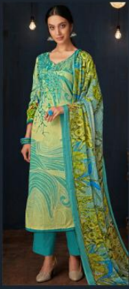
{ 8902 }