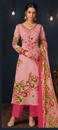
{ 8903 }