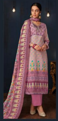
{ 4906 }