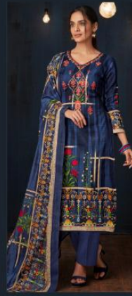
{ 4905 }