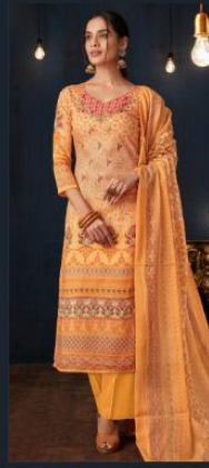
{ 8904 }