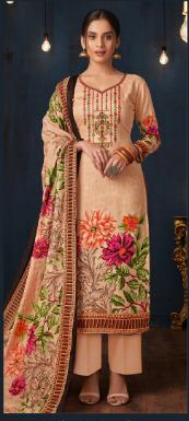
{ 8901 }