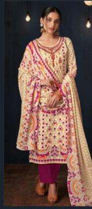
{ 8910 }