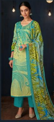
{ 8902 }