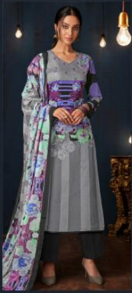
{ 8909 }