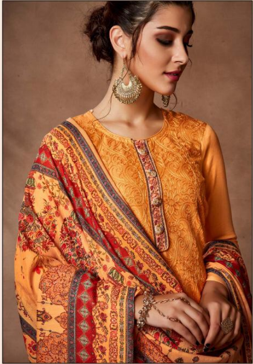
DESIGN NO 121-004