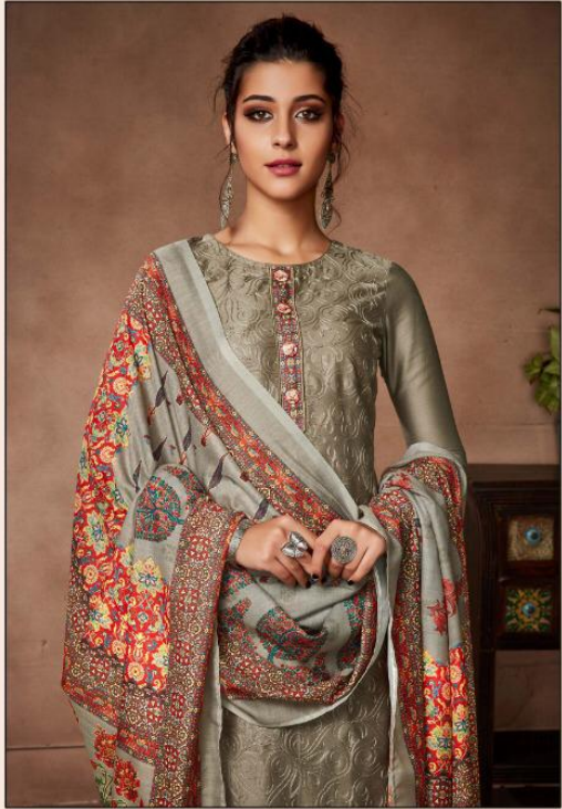
DESIGN NO 121-006