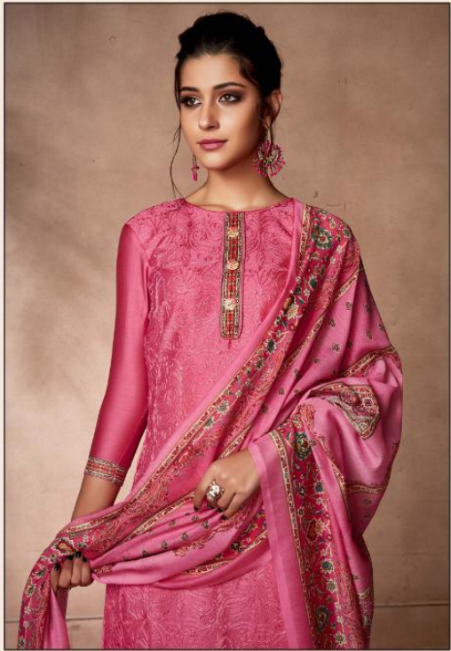
DESIGN NO 121-001