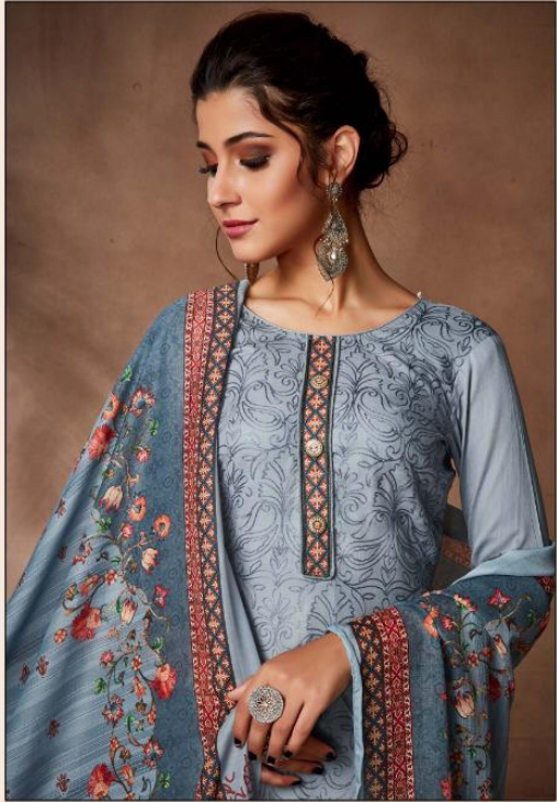
DESIGN NO 121-005