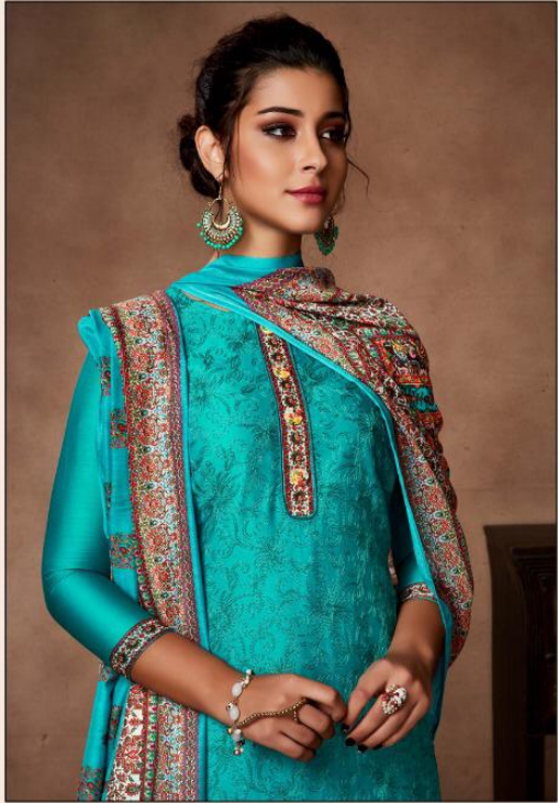
DESIGN NO 121-002