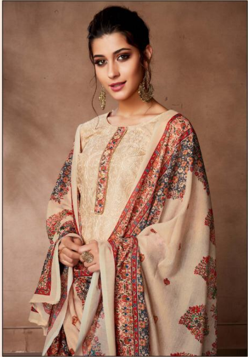
DESIGN NO 121-003