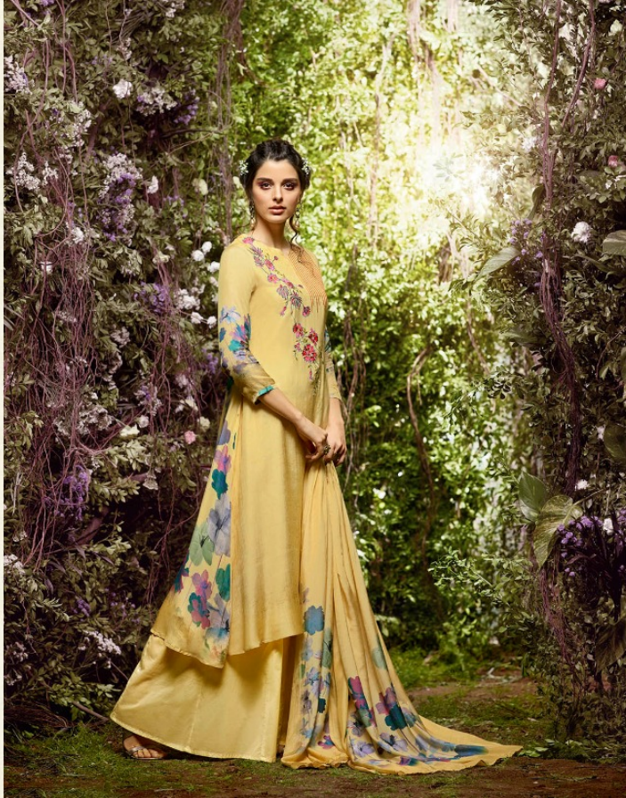
An ethnic tale Enhance your ethnic style with twists and turns. 2504