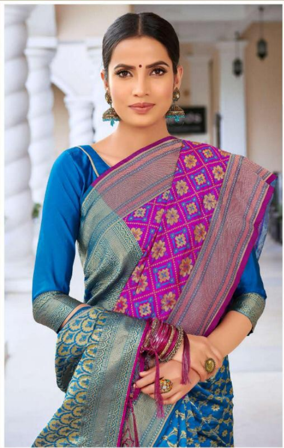
evole ppqj avrot aluzas essonviale cabbu em collection Design No.1005